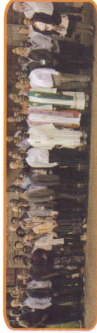
People In Mission (PIM) Conference 2019 held in Nairobi Kenya